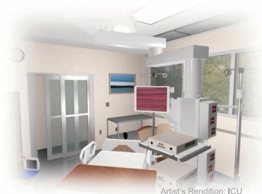
Artist's Rendition: ICU